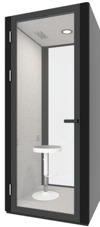
SKU: BQ-SPOD BL-GP18-BK