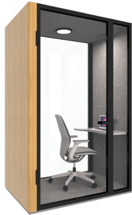
Custom Order Only